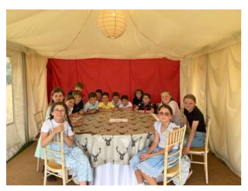
Ibfest – Carnival of the Animals