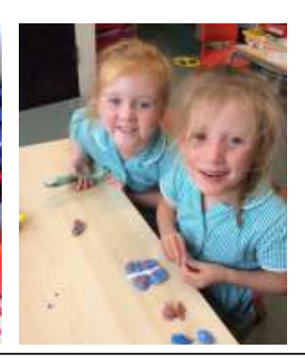
Love – Courage – Respect – Community – Perseverance 'Whatever I have, wherever I am, I can make it through anything in the One who makes me who I am' Philippians 4:13