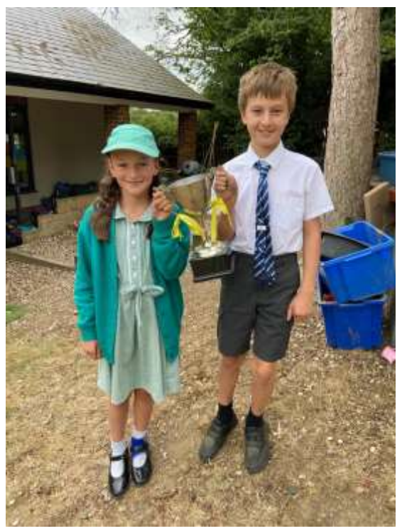
Well done Baker!