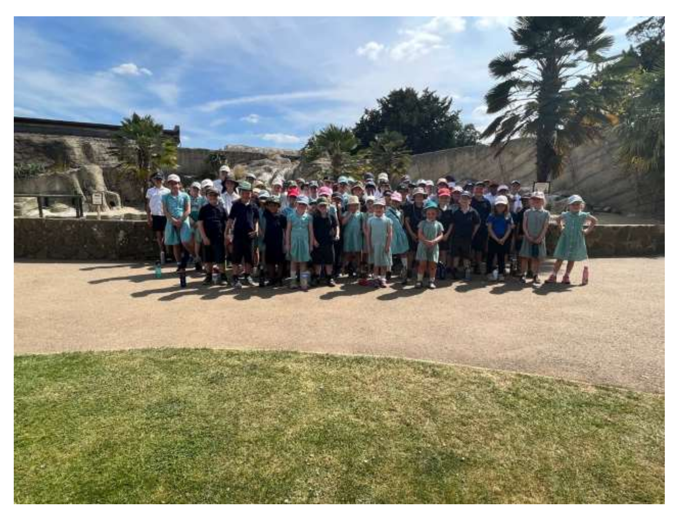
Love – Courage – Respect – Community – Perseverance 'Whatever I have, wherever I am, I can make it through anything in the One who makes me who I am' Philippians 4:13