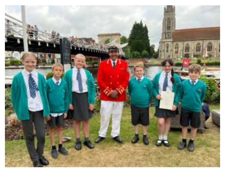
End of Year Celebration