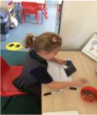
We had our own way to cool down on the hot days!